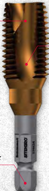
7/16" Hex Impact Shank